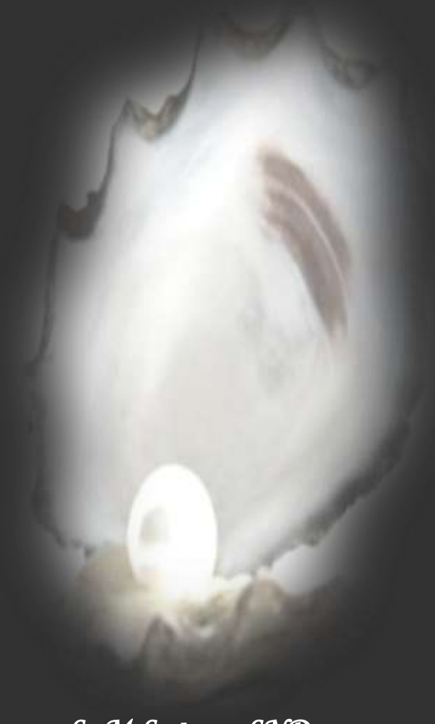
\mathcal{S} r. \mathcal{M} . \mathcal{S} yaloma \mathcal{S}\mathcal{N}\mathcal{D}